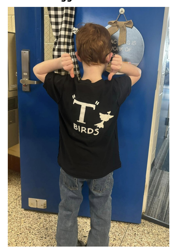
The Aggie Cafe Crew and students enjoyed some decade fun for a week in January