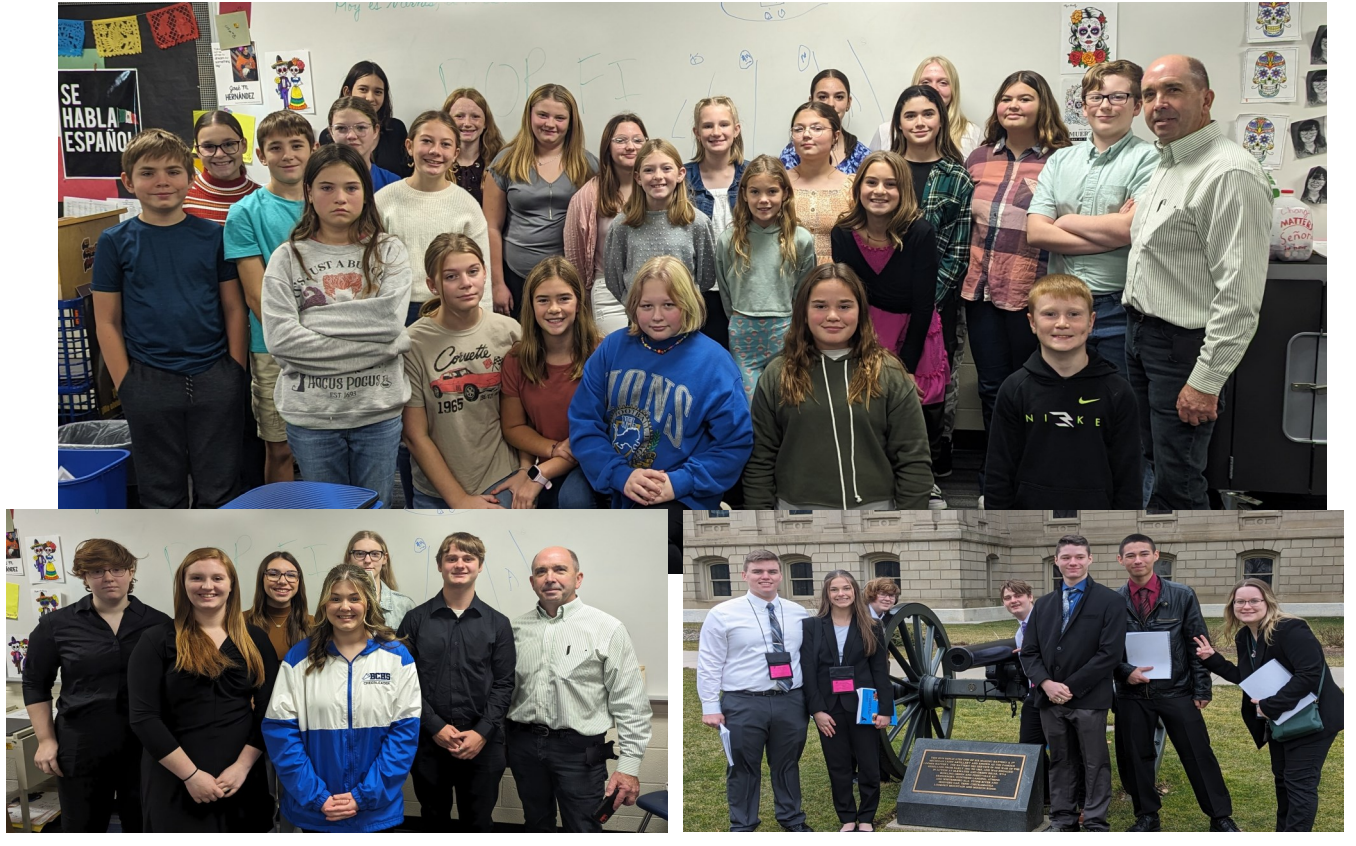
Beal City Students Take Charge with Youth in Government!

Beal City students are making their voices heard! Both the middle and high school branches of the Youth in Government (YIG) program are actively engaged in learning about democracy, honing their leadership skills, and advocating for change.